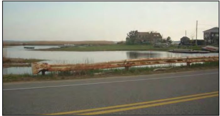
Plum Island Turnpike, Newbury

Bridges exist within many communities on the Byway. Maintenance and improvements to those structures are the responsibility of MassDOT. Municipalities should work closely with MassDOT to ensure that maintenance and modifications consider impacts to the Byway.