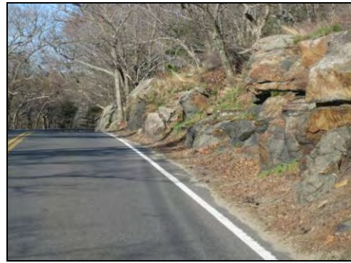
Stone outcroppings in Rockport

A few segments of the Byway contain ledge faces or outcroppings that ‘engage’ the roadway. Most of these are presently in very low speed locations and are without guardrails or barriers. These natural features contribute to an understanding of the history of the roadway and the challenges of construction along a rugged coastline. Unless proven to be significant safety concerns, the ledge should be considered a contributing resource and preserved through the exploration of options such as narrowing travel lanes, refining horizontal alignments, or modifying posted speed limits.