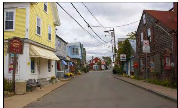
Bearskin Neck, Rockport

Identifying the key contributing resources of an area type that make the roadway segments unique is essential for developing strategies that address the interface between these built or natural elements and the engineered roadway cross-section. Whether existing elements are a primary design constraint or are part of the general context, it is critical that they be considered at the start of any design process to incorporate them successfully into roadway modifications. While these elements are present in varying degrees, most of the communities have features represented within the following categories of features.